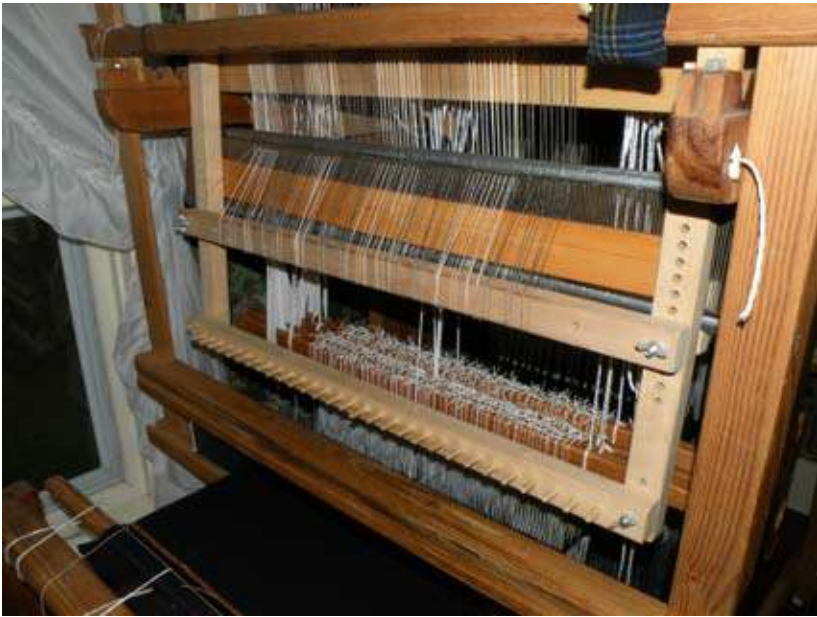
single unit draw