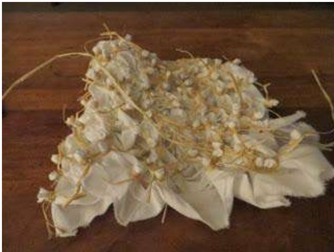
Indigo dying preparation, pigeon eyes

..... : "Oh what : a tangled : web we : weave : when first : we : practice : to : weave."