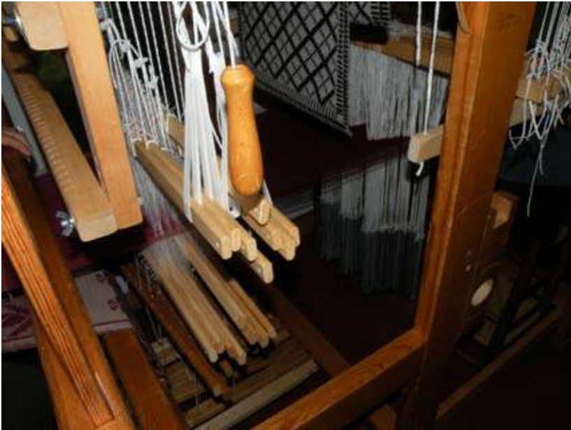
close up of ground and pattern