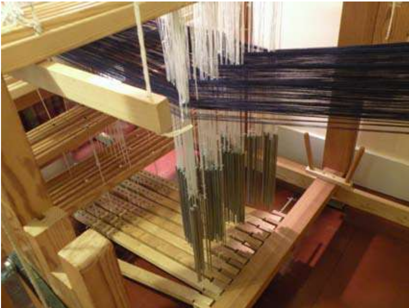
example of point threading in pattern shafts