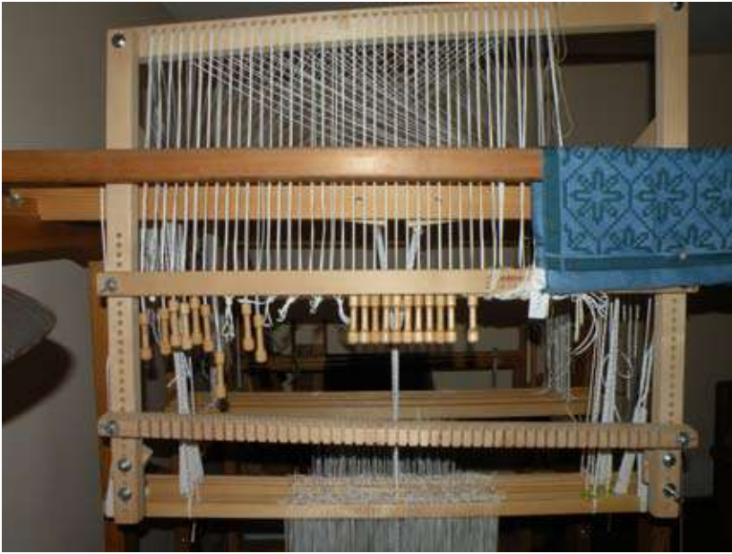
single shaft unit attachment