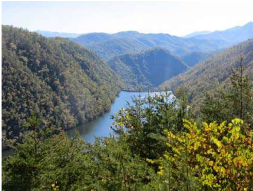
View from the top of US 129 (aka the Dragon" or "The Dragon's Tail")

Here is the blog my daughter wrote about our indigo dyeing week. http://penguinalley.blogspot.com