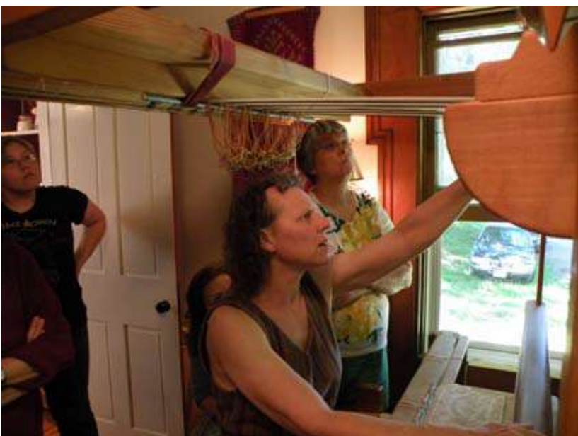
loom with lashes overhead