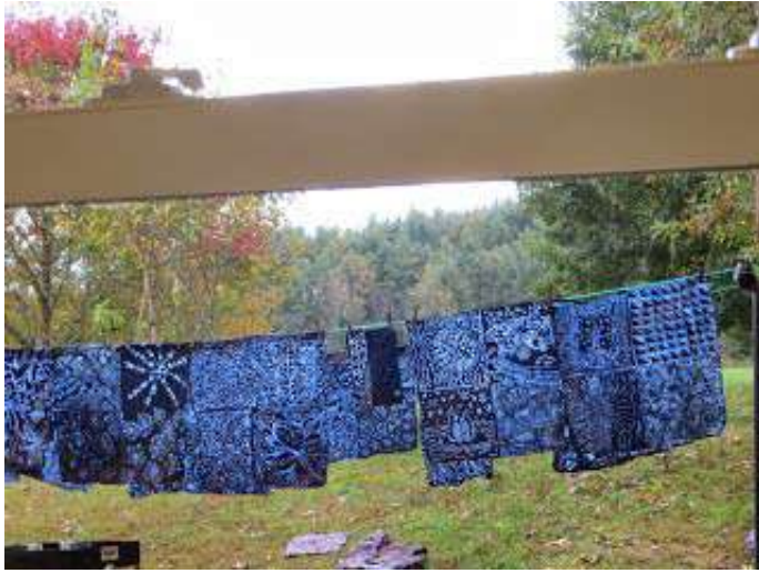
Indigo designs drying