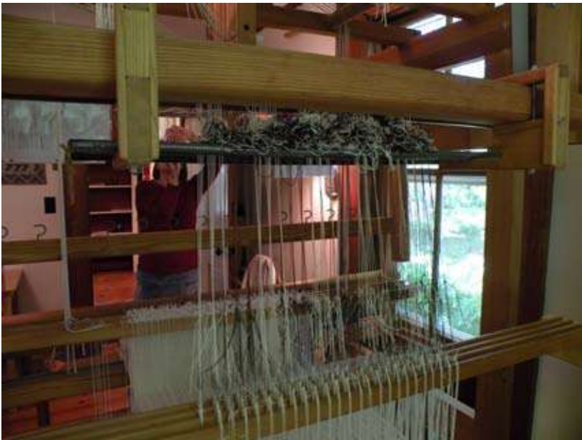
stored lashes at the back