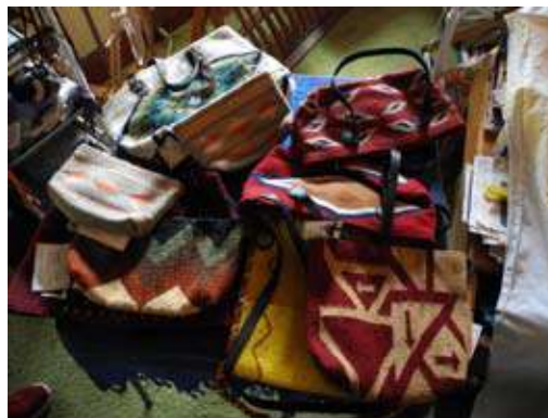
Marcos Bautista hand bag design collection