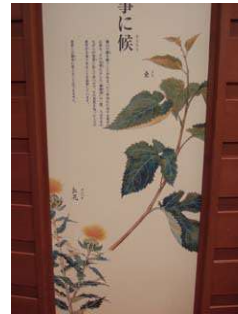
Yonezawa City Uesugi Museum Safflower exhibit