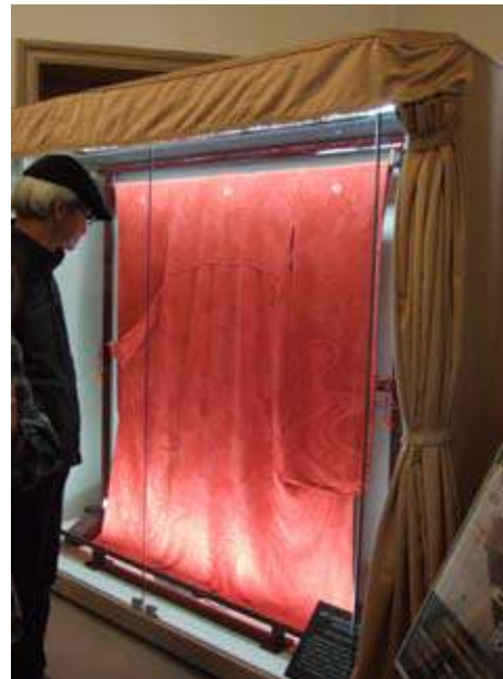
Yamagata Prefecture Museum Safflower dyed kimono