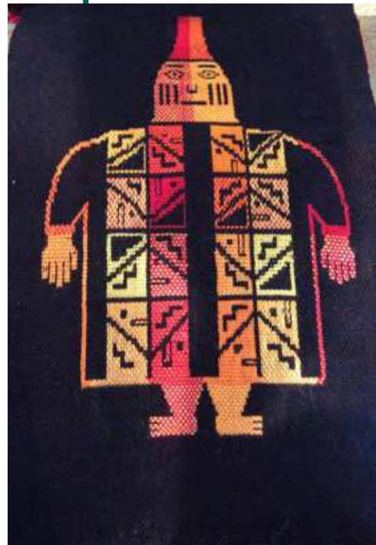
CMA Wari Exhibit was Ele's Inspiration