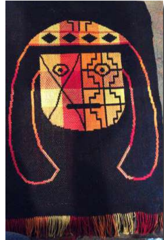
CMA Wari Exhibit was Ele's Inspiration