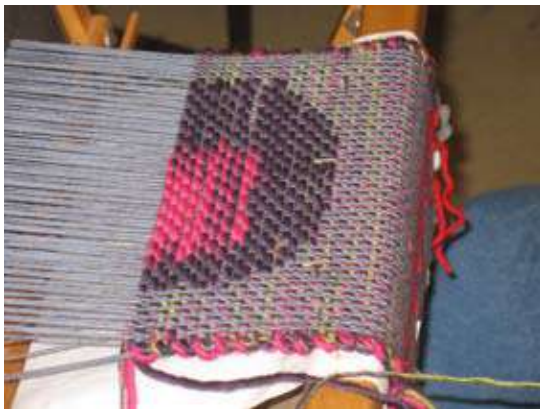
Views of our “peerless pears” Note the cloth cartoon technique