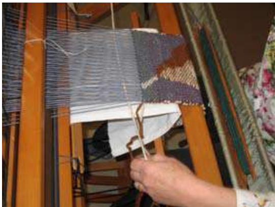
Top right, above and bottom right: Trio of show and tell from February’s Study Group