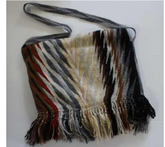
Finger woven computer bag

We also discuss pattern reading and writing and decorating with beads.