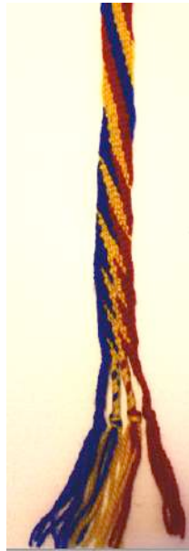
Finger woven strap