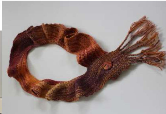
Finger woven curly neck scarf