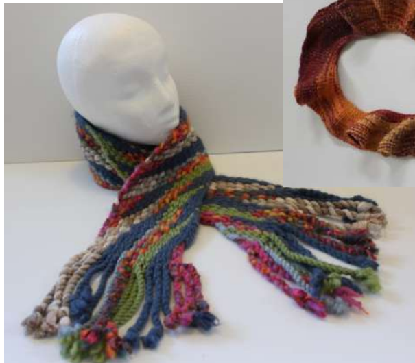
Finger woven neck scarf