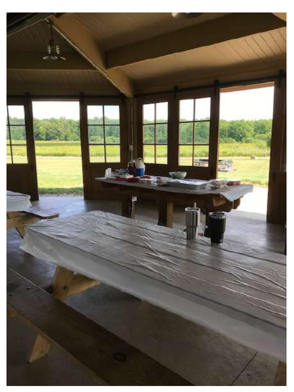
Cuyahoga Weavers Guild